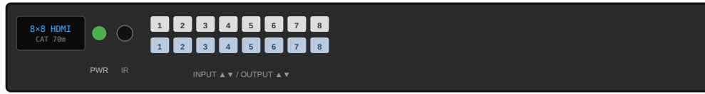
Front Panel — MMX-8X8CAT-70M (Nixie tube display)