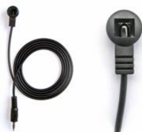
38KHz IR Receiver

NOTE: Be sure the remote control has direct line of sight to the IR receiver end. IR requires open line of sight between the remote and the receiver in order to work properly.