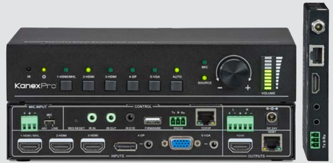
SW-HDSC51HDBT 5 Input Seamless Presentation Switcher over HDBaseT up to 230ft.

The KanexPro Seamless Presentation Switcher and Scaler features five inputs, including HDMI, DP and VGA, with one local HDMI output and one HDBaseT output. Supporting instant switching with zero latency, the Seamless Presentation Switcher and Scaler is compliant with the latest HDCP 2.2 specs, supports CEC commands and EDID management, and the output can be extended with Power over HDBaseT (PoH) up to 230 feet. With a built-in audio de-embedder for HDMI and VGA inputs, the Seamless Presentation Switcher and Scaler includes an IR remote, as well as control via buttons, RS232 and web-based GUI. For more product information please click here .